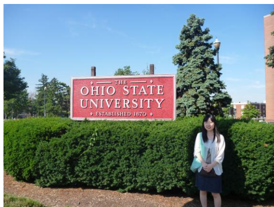
Fig.3 In front of the OSU University